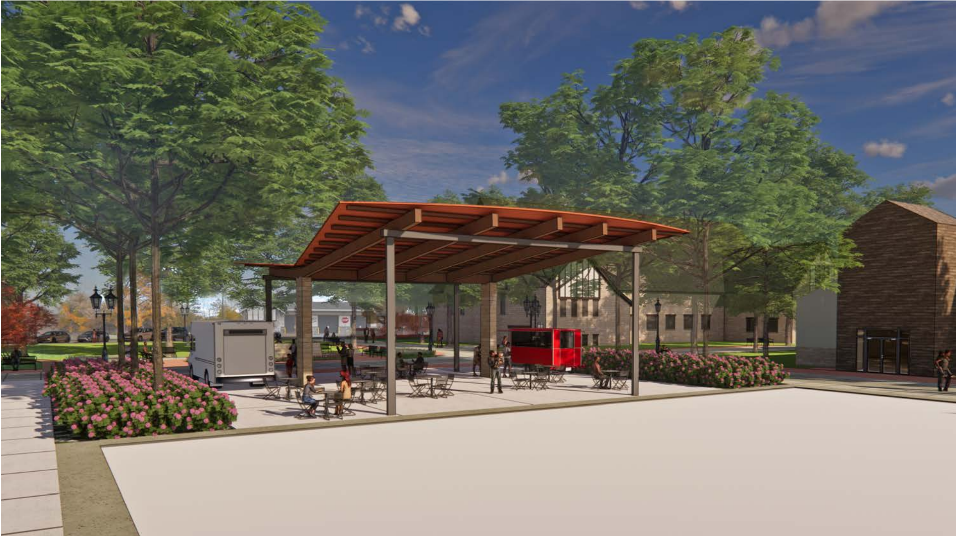
Central Plaza with Optional Shade Structure / Canopy