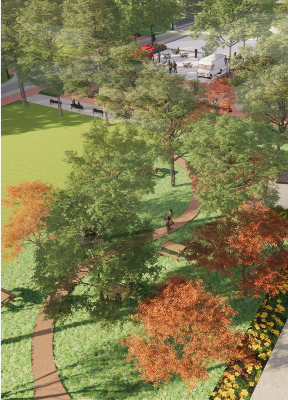
Birdseye View of Memorial Grove