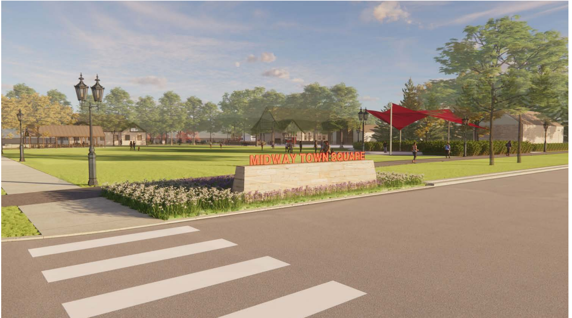
Gateway Monument on corner of 100 N and 200 W