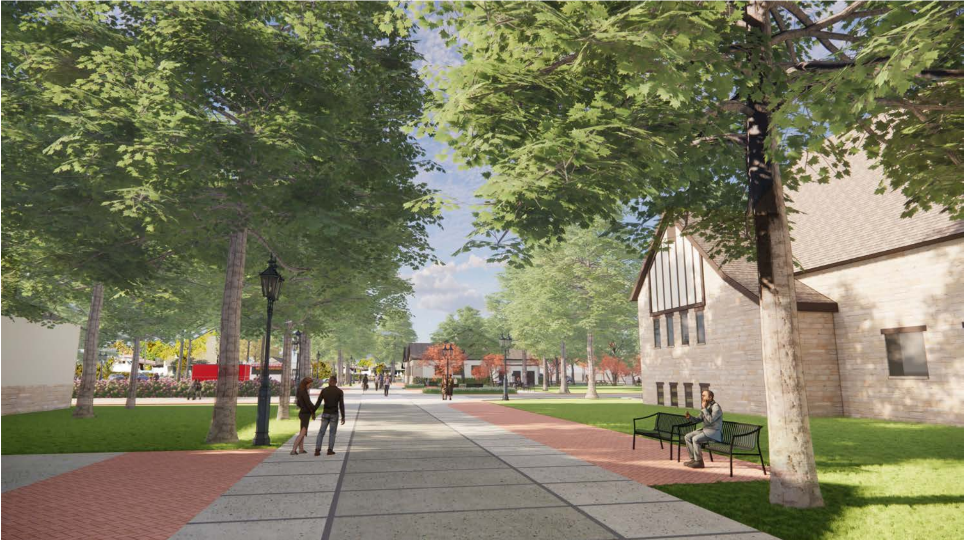
Looking North down the North / South Promenade