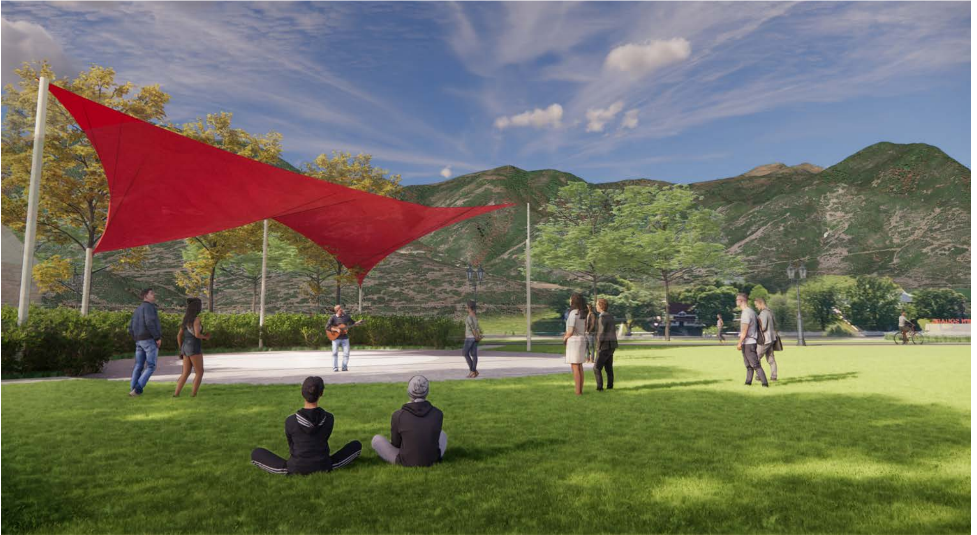
View of Small Multipurpose Plaza