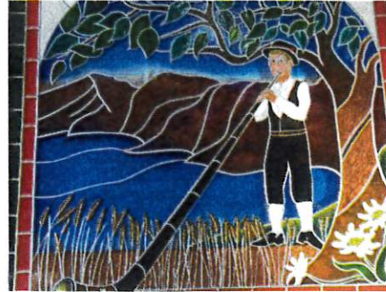
Windows when first painted and as they appear now on the Cannery building