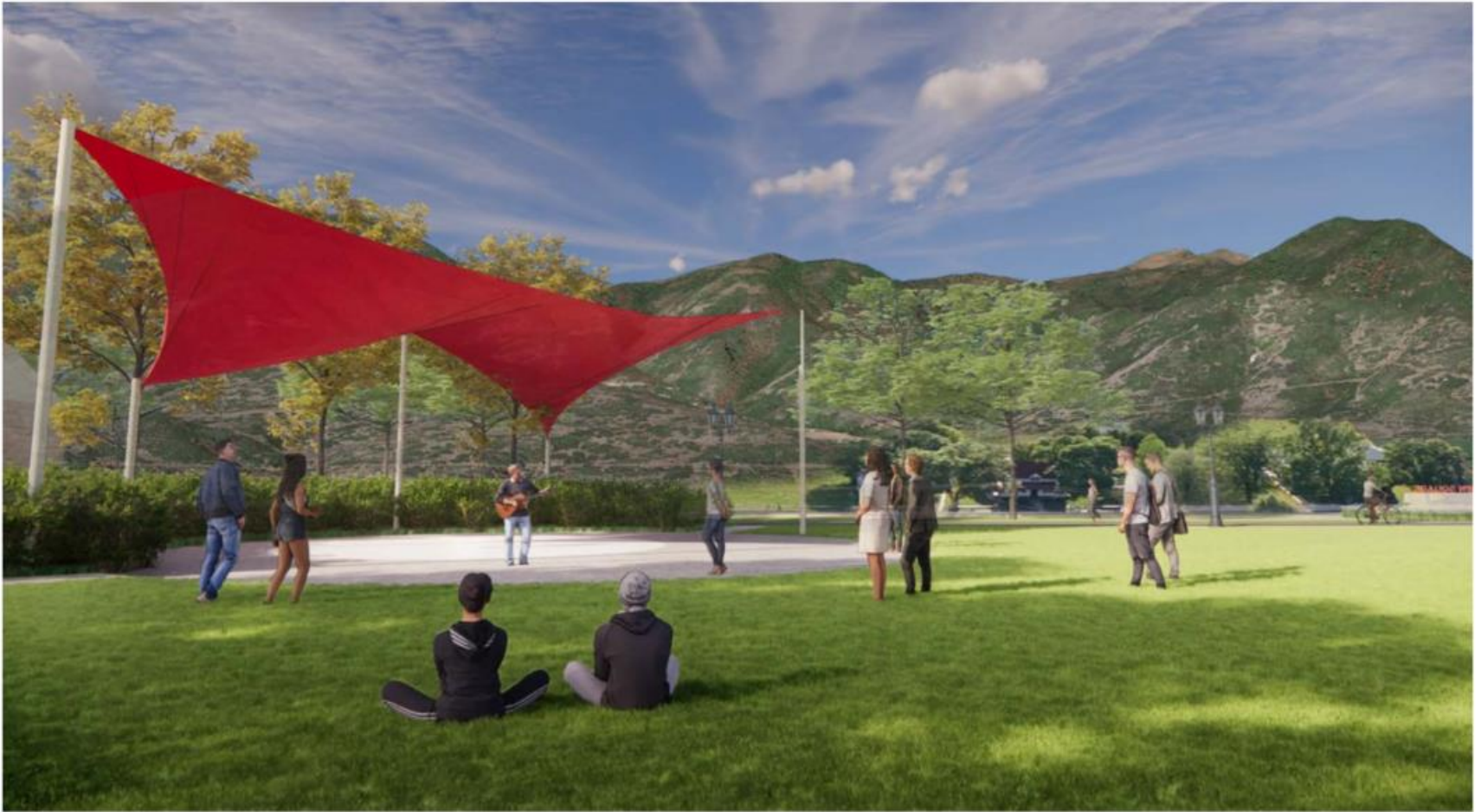
View of Small Multipurpose Plaza