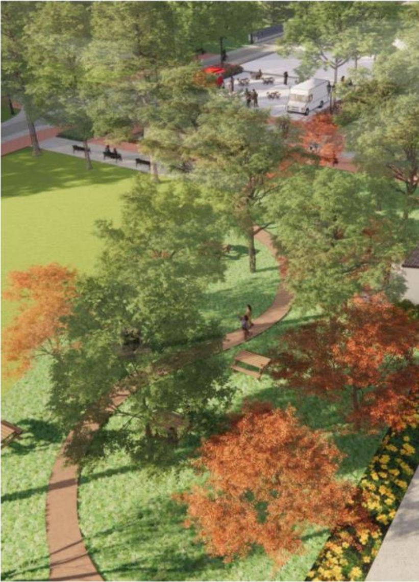
Birdseye View of Memorial Grove