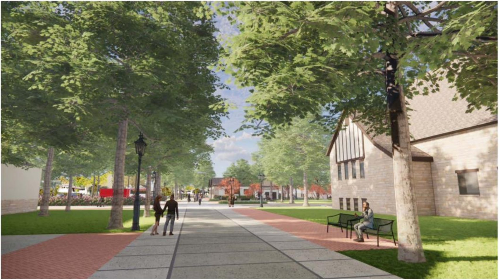
Looking North down the North / South Promenade